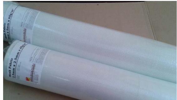
Waterproof Mat Model