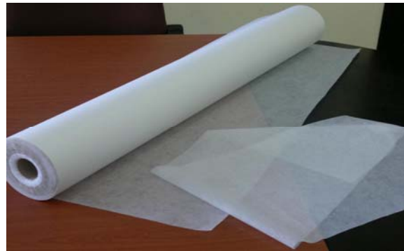
Waterproof Mat Fabric (Non Woven)